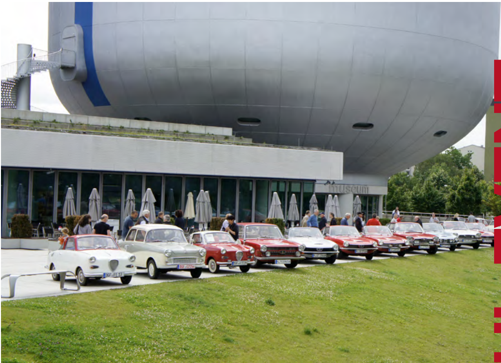
One of the highlights: Parking in front of the BMW Museum

We then visited the BMW Museum. For many it was the first visit since the conversion in 2009 and several were quite astonished at what they saw. However, there are always new things to discover, even for those familiar with the museum. In addition to GLAS there is also a special motor racing exhibition.