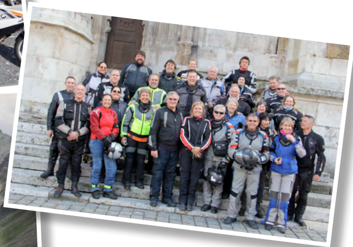
Great mountain passes, stunning landscapes, friendship and good food will be lasting memories of this fantastic tour